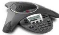
Polycom SoundStation IP 6000