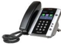
Polycom VX 500