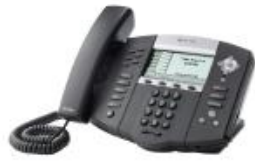
Polycom SoundPoint IP 550 & IP 650