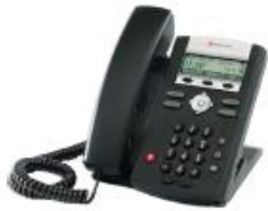
Polycom SoundPoint IP 331