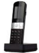
Cisco SPA 302 Cordless